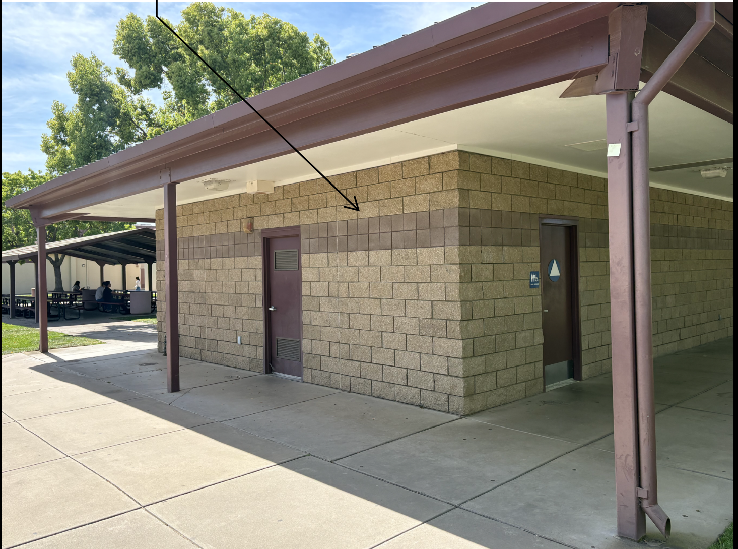
BUILDING "M" FROM NORTHEAST CORNER